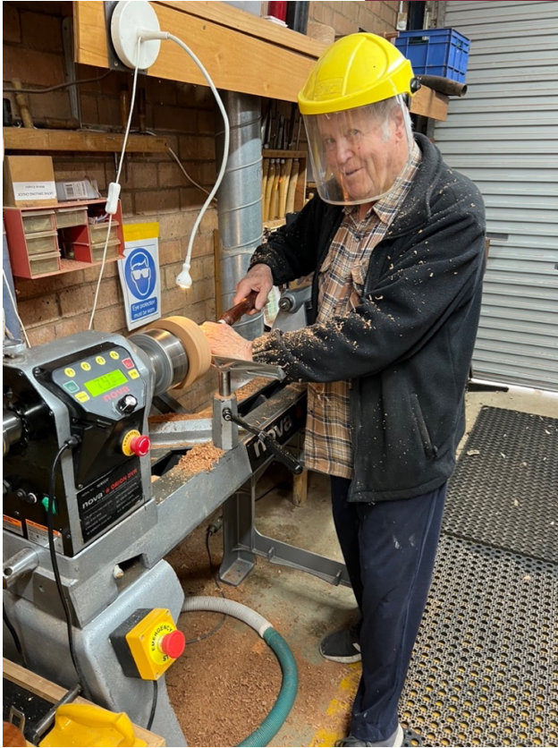
An old hand on a new lathe