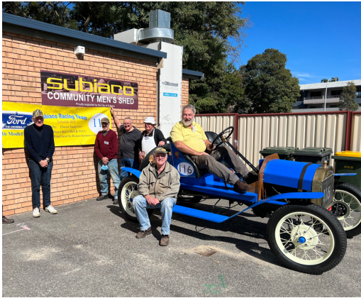
Fixing wood parts on an old banger