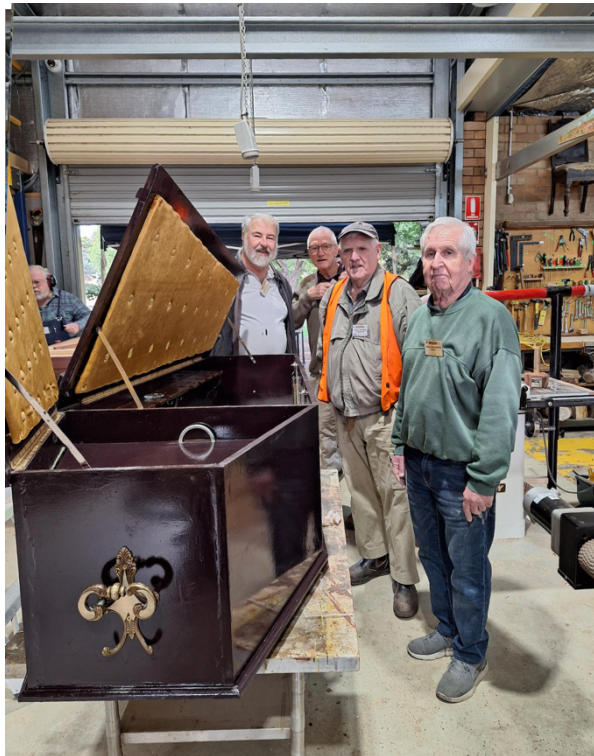
It's a Bar!