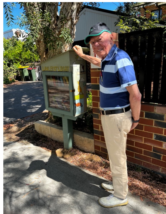
Childrens' Street Library